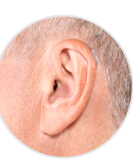
The TruLink Hearing Control app, partnered with A4i iQ, is easy and intuitive to use with iPhone and select Android devices.