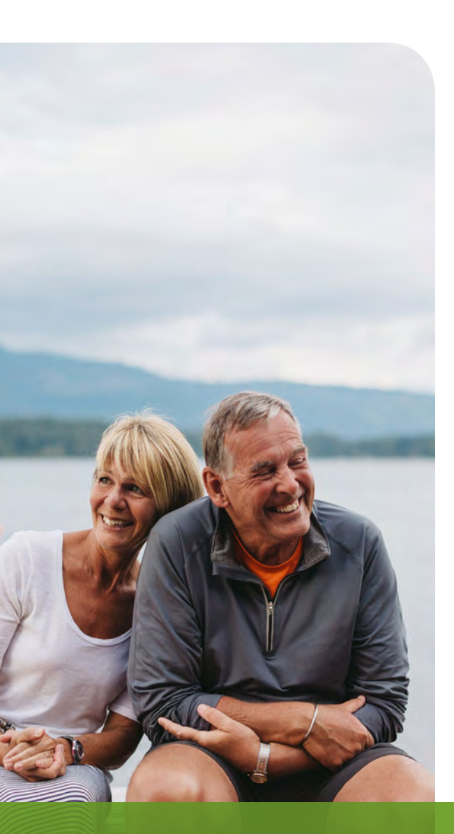
Invisibel Synergy iQ has it all with invisible, custom solutions.